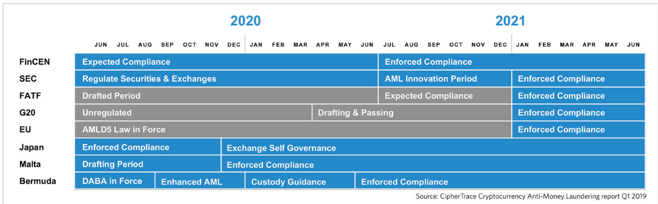
Global Cryptocurrency AML Timeline